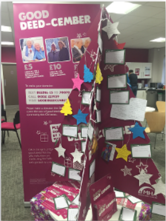
Our Christmas Tree full of Good Deeds

So again, thank you for helping us making this Christmas a little less lonely for so many, many older people throughout the country.